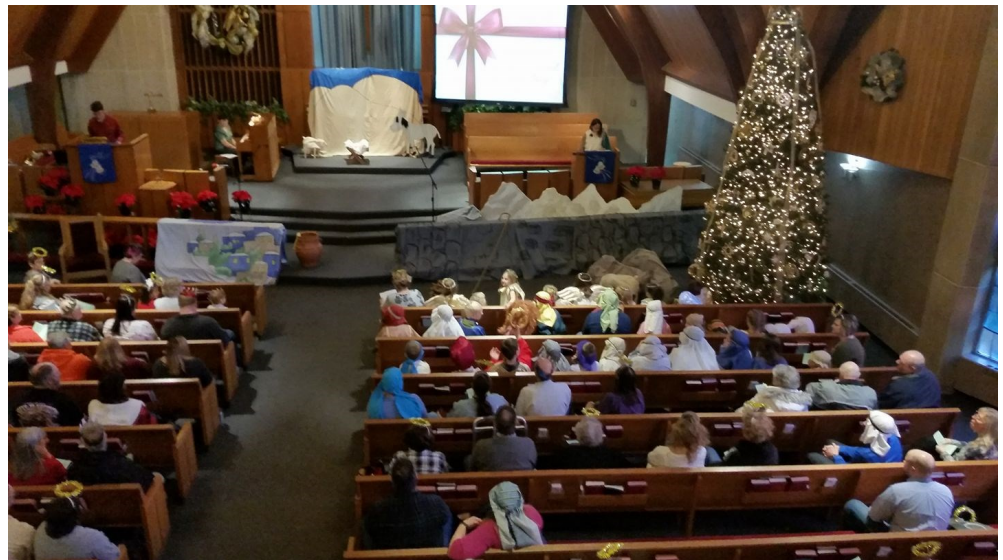
Angels, shepherds and wise ones in the sanctuary audience!

Vacation Bible School 2019 June 17-21 VBS Sunday June 23