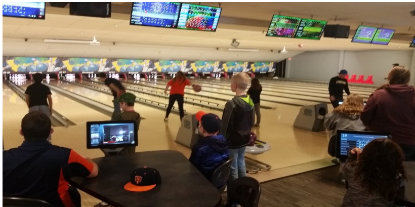
Bowling at Pleasant Lanes

Our Methodist Youth Fellowship (MYF) has had a great year! We have enjoyed outings to Grady's, Pleasant Lanes bowling, the trampoline park, roller skating, rock climbing and a scavenger hunt in Pontiac. We have also gone to the Bishop's Retreat, Beautiful You Conference in Troy, and a district rally. Weekly we meet on the third floor for devotions and small group. Currently 30 youth and adults are attending MYF.